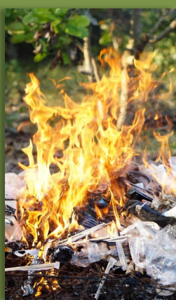
Burning plastic can affect air quality, public health