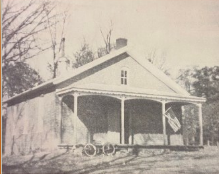
Rossville school, now Warrington Twp business office

The Warrington Township Extra is a newsletter supplement to inform residents how the township runs to increase community interest and awareness.