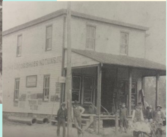
Seifert Dry Goods Store, early 1900's, Rossville

The Warrington Township Extra is a newsletter supplement to inform residents how the township runs to increase community interest and awareness.